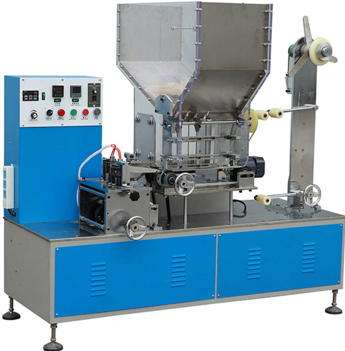
PAPER STRAW PACKAGING MACHINE (SINGLE PACK)